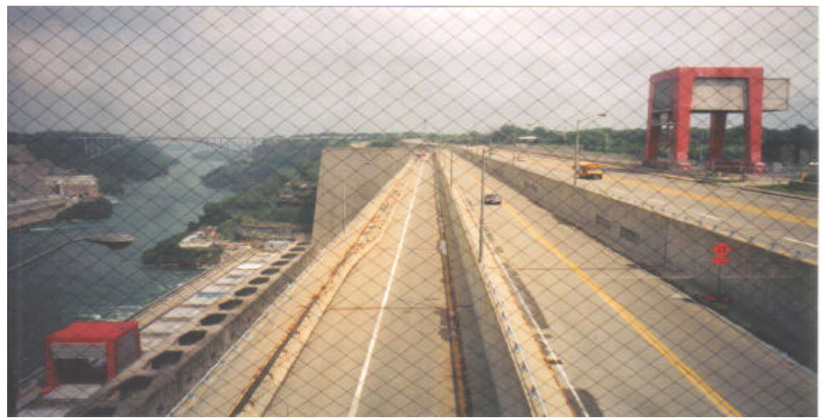
View north parkway lanes across Power Plant/Lewiston Road, top right

A naturally restored gorge rim would add over 300 acres to the Globally Significant Important Bird Area, expanding valuable wildlife habitat, and reclaiming the natural environment of this culturally and historically important landscape.