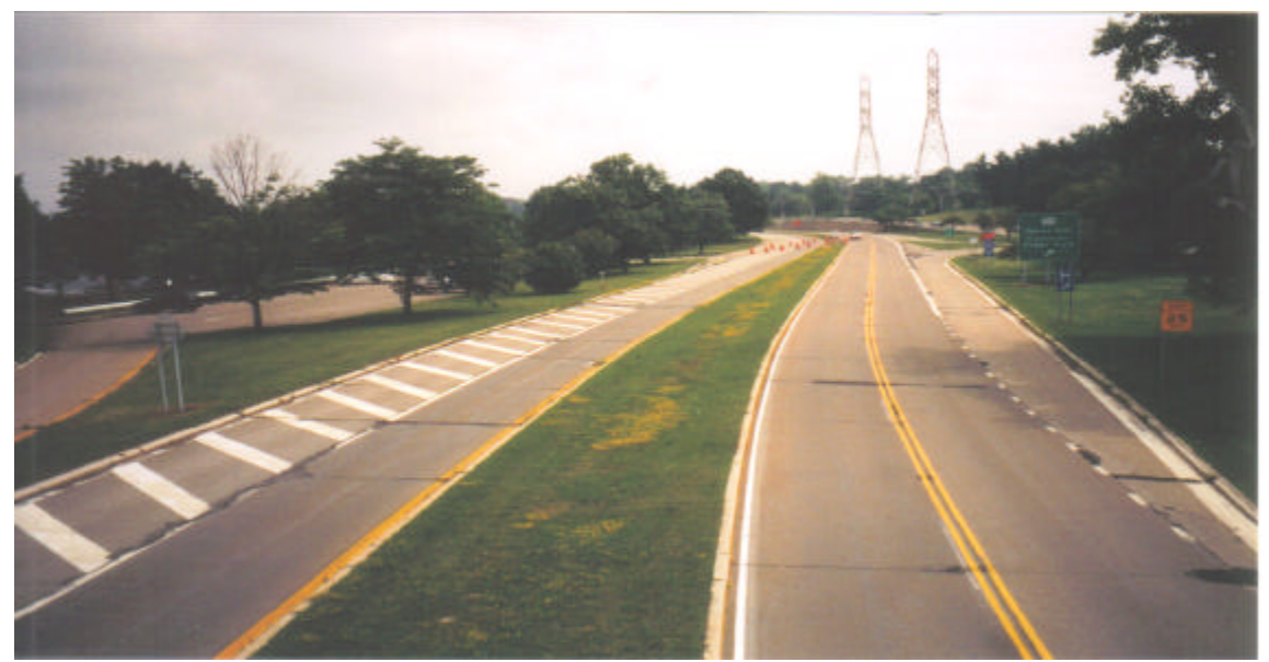
View north, land to left of roads is Devil's Hole State park

Hundreds of tons of salt are spread annually on this highway along the gorge rim. Routine herbicide application to hinder "undesirable" vegetation may contribute to this contamination introduced near an environment supporting centuries-old white pine and other botanical communities unique to New York State. OSPRHP, incidentally, documents 231,768.75 tons of carbon emissions annually from vehicles using the gorge parkway.