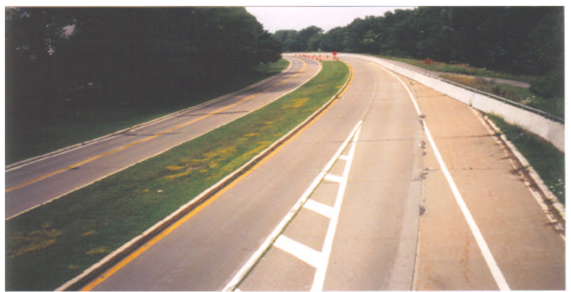
View south parkway lanes approaching Whirlpool State Park

RMP removal has been forwarded in the relicensing process by two RCC subcommittees: 1) Planning/Economic Development/Watershed and 2) Land-Use/Ecology/Environment. This proposal for removal and restoration is supported by the Seneca Nation of Indians. It is also supported by the Niagara County Environmental Management Council as well as the Erie County Environmental Management Council. Additionally, the proposal for RMP removal and gorge rim restoration is endorsed by thousands of individual citizens, and a broad coalition of 65 organizations, including business groups, bicycling clubs, environmental organizations, Niagara Falls block clubs and others, with a combined membership of well over one million. RMP removal would create waterfront access and significant wildlife habitat, protect the watershed, and create a genuine greenway along this most unique length of river corridor.